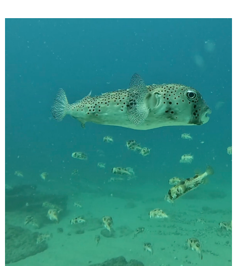
Today, Cabo Pulmo Natural Park is considered a protected natural area, that is home to reefs estimated to be about 20,000 years old, considered a marine treasure of the Baja peninsula.

Sharks, gigantic rays, humpback whales, sea turtles and ospreys are among the many species returning each year to Cabo Pulmo to breed, feed and live in an unsurpassed submarine shelter.