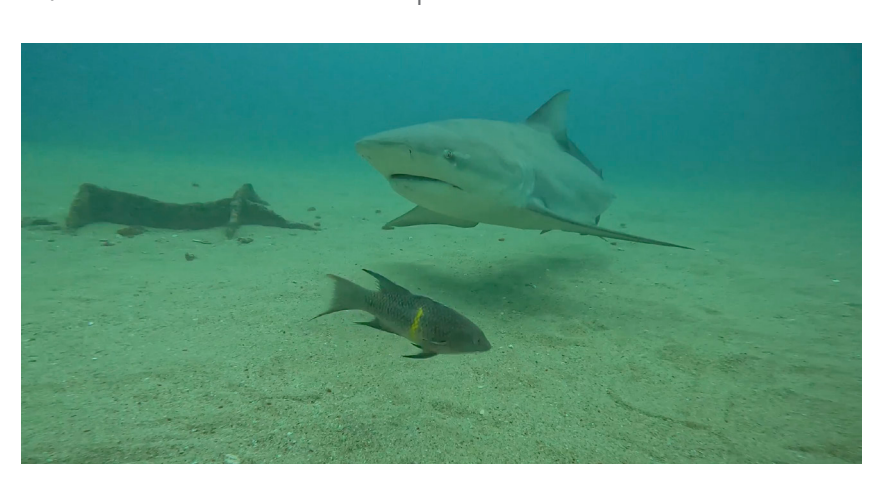
Underwater photos courtesy of diver Pepe Moreno